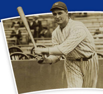
▲ Lou Gehrig's disease was named after a famous New York Yankees baseball player.