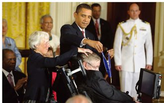
▲ Hawking getting an award for his work

2 Hawking is one of the world's greatest scientists. He has spent his life solving the mysteries of the universe . He has written many important papers. For his work, he has received many awards.