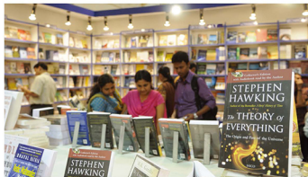
▲ Hawking's books on display at a bookstore