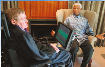
▲ Hawking using a computer to talk

his speech unclear . Later, he couldn't talk at all and had to use a special computer to speak.