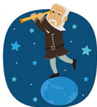
▲ Hawking was born on January 8, 1942, the 300 th anniversary of Galileo's death.