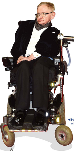
◀ Hawking sitting on a wheelchair

3 Moving wasn't the only problem for Hawking. He had problems speaking, too. He couldn't control the muscles in his mouth and throat . This made