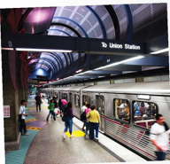
My mom takes the subway to work.

People drive too much, and it makes the air dirty. In my family, we don't drive a lot. My mother takes the subway to work. It takes half an hour. My sister's school is fifteen minutes away, so she walks to school. I take the bus to school, and it takes twenty minutes. Only my father drives to work because it's very far. We try to keep the air clean. It's really important.